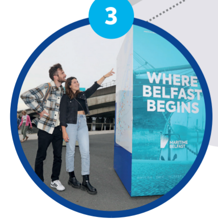
Learn about Belfast's Maritime Heritage at the 'Where Belfast Begins' outdoor exhibition on Queens Quay.