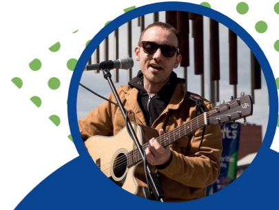
Experience the best of local music talent with Sundays on the Maritime Mile throughout May & August. Look out for pop up performances including opera, singer-songwriters, jazz, trad, folk, indie & electronic.

Check website for weekly locations