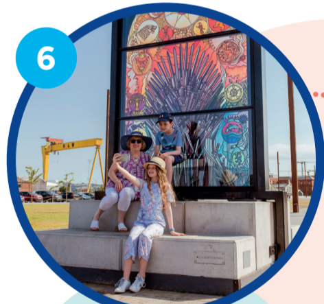
Rediscover the most famous moments from Game of Thrones on the Glass of Thrones Walking Trail, that starts at AC Hotel Belfast and finishes at HMS Caroline.