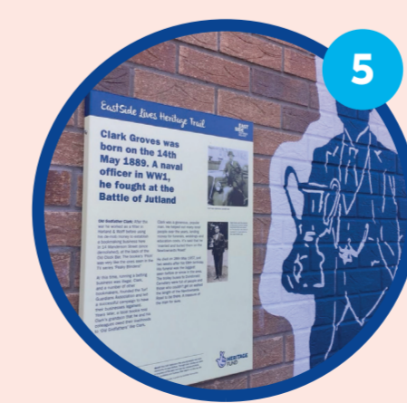
Follow the EastSide Lives Heritage Trail through East Belfast.