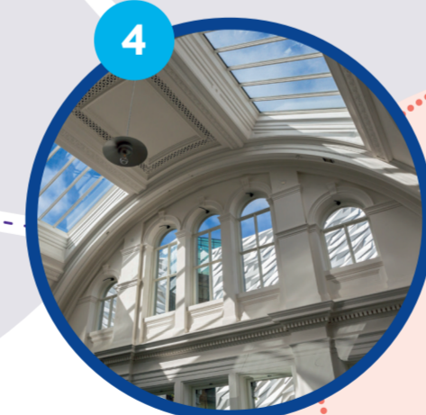
Explore the Drawing Offices and heritage rooms in Titanic Hotel Belfast.*