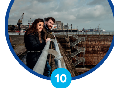
Visit two of the world's biggest dry docks of their time, Alexandra and Thompson.