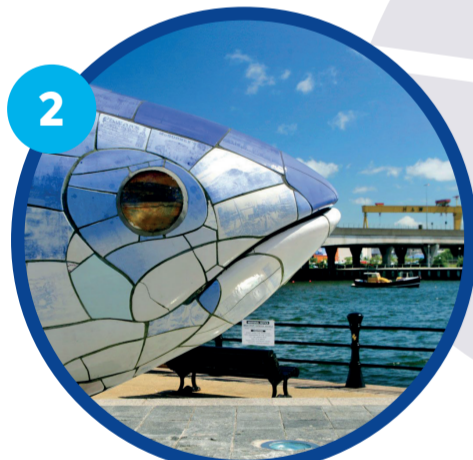
Explore the unique public art dotted along the waterfront