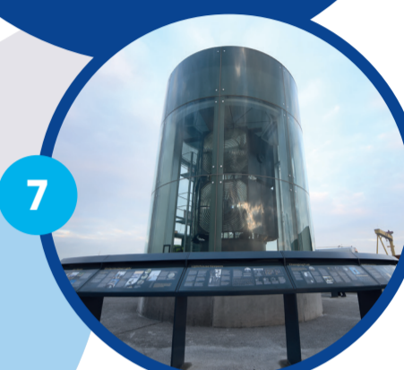
If you are exploring the Maritime Mile in the evening, make sure to check out the Great Light as it is lit every night, and on special occasions turns different colours.

Check website for weekly locations