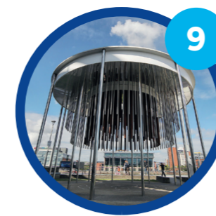
Jump into SoundYard and see if you can set off the hammering and clanging sounds heard in Belfast's shipyards.