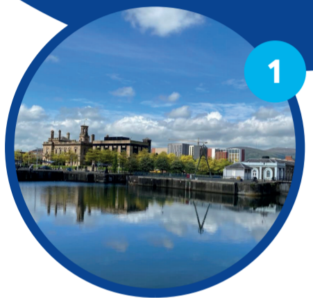
Dive into Belfast's seafaring history and start your maritime experience at Clarendon Dock and Sailortown